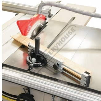
Shown on a Table Saw