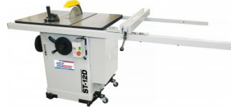
W455 Table Saw