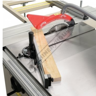
Shown on a Table Saw Side View