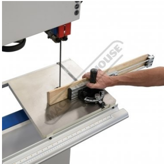
Shown on a Wood Bandsaw Action