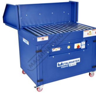
Side doors open