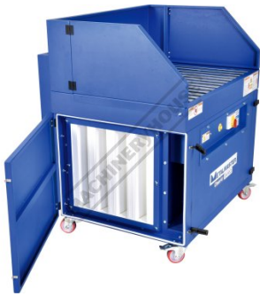
Filter door open