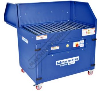
Side door open