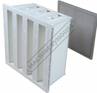
Dual Stage Filter System