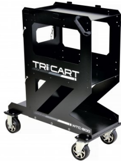
W2415 TRI-CART Multi-Machine Welding Trolley