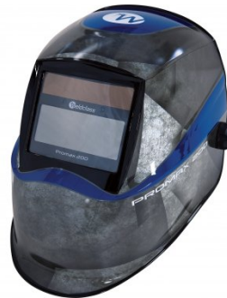
W001 Auto Darken Welding Helmet - 9-13 Shade