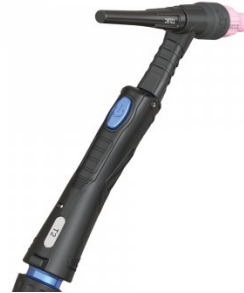
W171F Air Cooled Arc Torchology® TIG Welding Torch