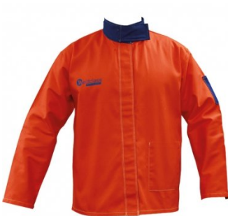
W1000A Promax HV5 Welding Jacket