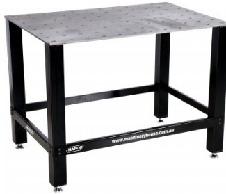
W08455 Welding Table