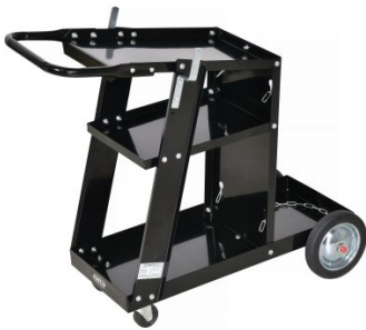
W2415 TRI-CART Multi-Machine Welding Trolley