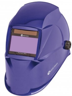
W002 Auto Darken Welding Helmet - 9-13 Shade