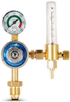
W161 Argon Gas Regulator-Bobbin Flowmeter