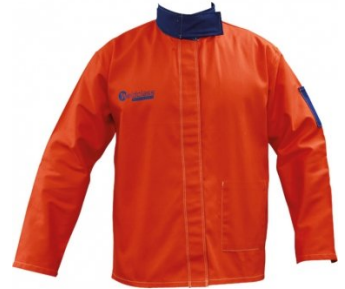
W1000A Promax HV5 Welding Jacket