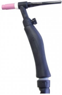
W171D Air Cooled TIG Welding Torch