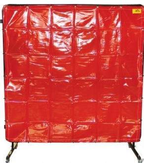
W225 Welding Curtain