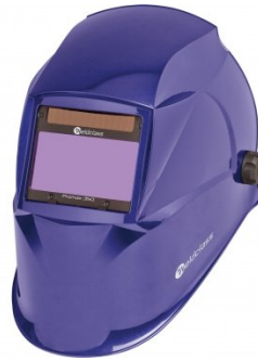
W002 Auto Darken Welding Helmet - 9~13 Shade