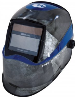
W001 Auto Darken Welding Helmet - 9~13 Shade