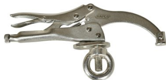
C103 228mm Multi-Purpose Locking Clamp