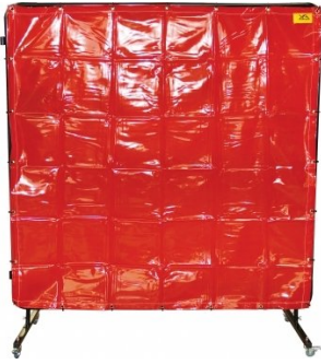
W225 Welding Curtain