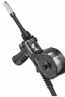
W181C Spool Gun - Light Duty