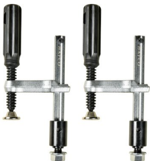
W08510 Weld Clamps with Locking Nuts (2 Piece Pack)