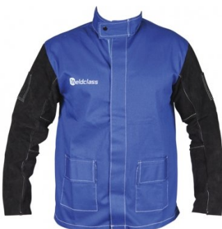
W1002A Professional Promax BL7 Welding Jacket