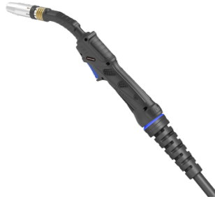
W563 MIG Torch - 3 Metre