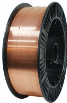
W136 Ø0.8mm Mild Steel MIG Welding Wire