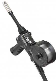
W181C Spool Gun - Light Duty