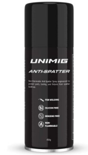
W119 Anti-Spatter Spray