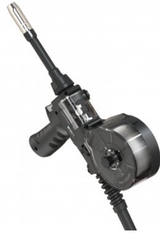
W181C Spool Gun - Light Duty