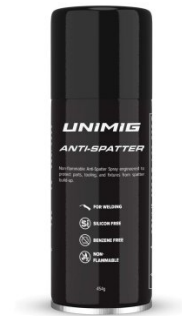
W119 Anti-Spatter Spray