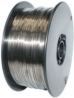
W145C Ø0.8mm Gasless Mild Steel MIG Welding Wire