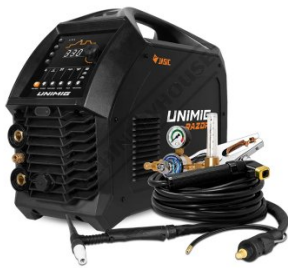
Shown with Included Accessories