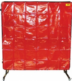
W225 Welding Curtain