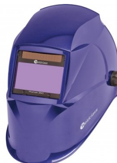
W002 Auto Darken Welding Helmet - 9-13 Shade