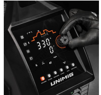
HD Backlit Interface