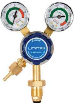
W160A Argon Gas Regulator-Twin Gauge