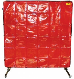
W225 Welding Curtain