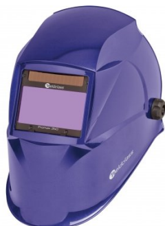
W002 Auto Darken Welding Helmet - 9-13 Shade