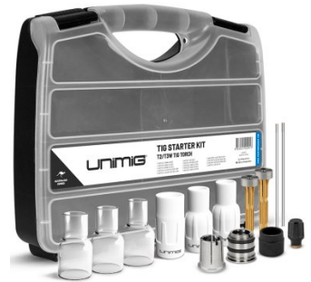
W504A T2 Tig Torch Consumable Pack