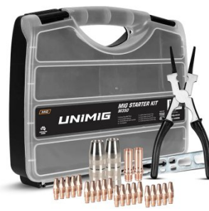
W501A M350 MIG Torch Consumables Starter Kit