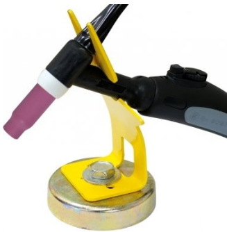
W10361 Magnetic TIG Torch Rest