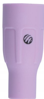
W5991 Ø10mm Ceramic Nozzle