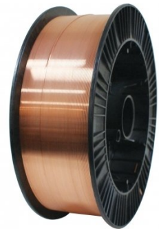
W136 Ø0.8mm Mild Steel MIG Welding Wire