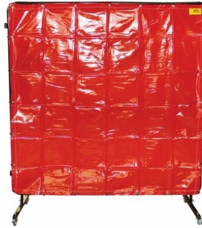
W225 Welding Curtain