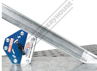
30 Degree Angle