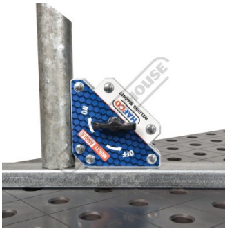
Round Pipe Compatibility