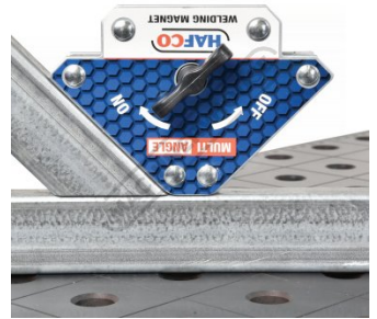
135 Degree Angle