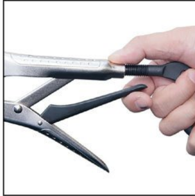
Quick release trigger.