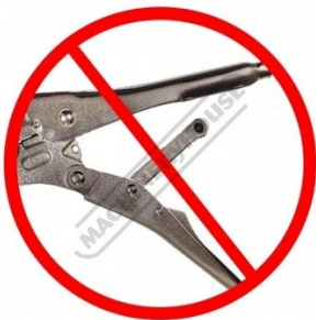
Secure Adjustment Bar minimizes bar pop outs