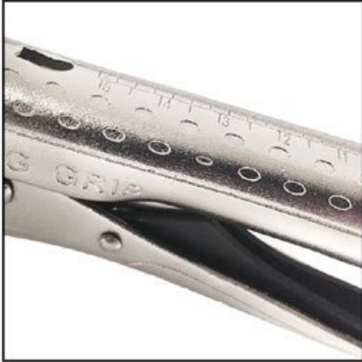
Non-Slip grip marks on top and bottom jaws for positive gripping