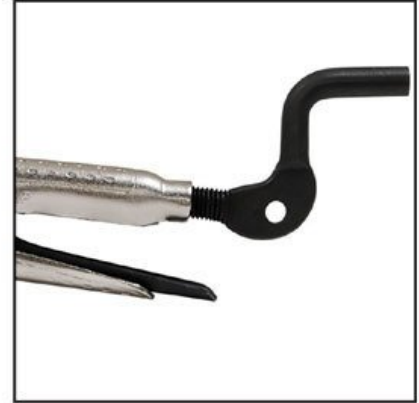
Unique crank handle for fast, easy jaw opening and pressure adjustment.