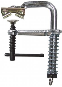
W07971 BuildPro Magspring Clamp