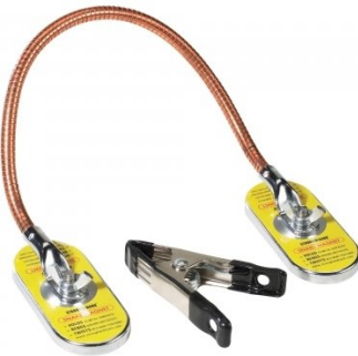
W1005 Snake Magnet & Spring Clamp