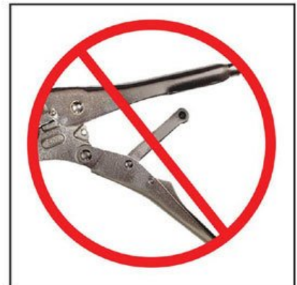
Secure Adjustment Bar minimizes bar pop-outs.