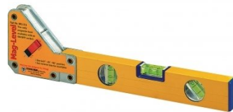
W1020 Magnetic Level