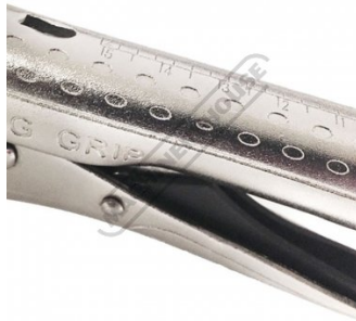
Non Slip grip marks on top and bottom jaws for positive gripping