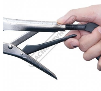
Quick release trigger