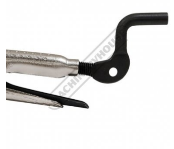
Unique crank handle for fast easy jaw opening and pressure adjustment