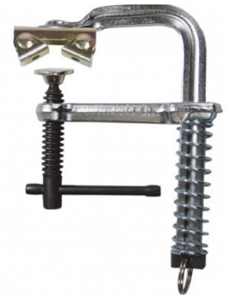
W07971 BuildPro Magspring Clamp