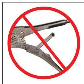
Secure Adjustment Bar minimizes bar pop-outs.

Minimal handle spread, even at the maximum opening, make these Pliers easier to grasp, lock, and release.