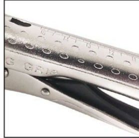
Non-Slip grip marks on top and bottom jaws for positive gripping