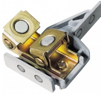
W112 Micro Welding Steel Clamp Set