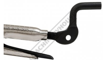
Unique crank handle for fast easy jaw opening and pressure adjustment