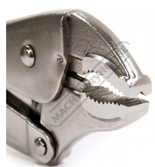
V Groove on top Jaw