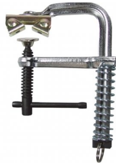
W07970 BuildPro Magspring Clamp