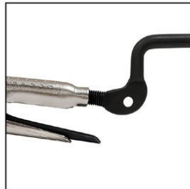
Unique crank handle for fast, easy jaw opening and pressure adjustment.

Crank up, or lessen the torque by inserting a screwdriver.