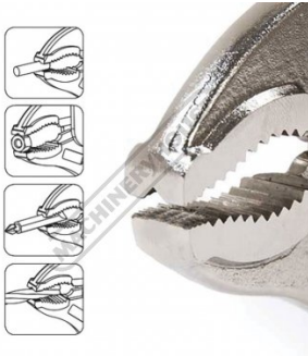
V Groove on top jaw for holding small parts