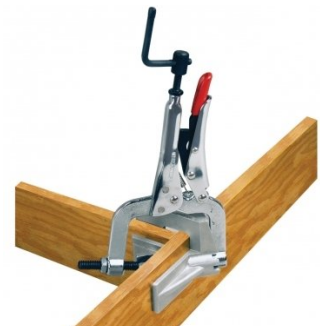
W1013 Corner Clamping Plier