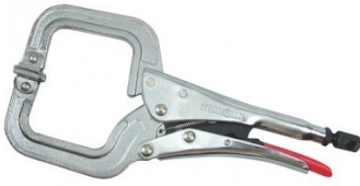
W1017 Locking C-Clamp - Swivel Tip