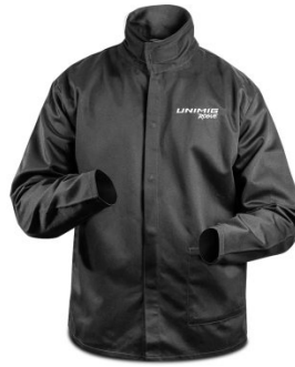
W1003 Rogue Welding Jacket