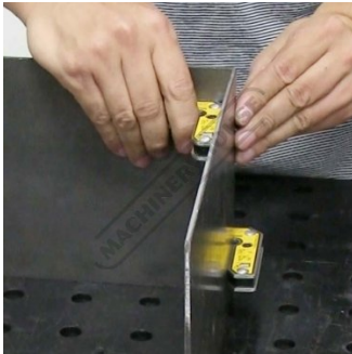
Shown in Use 2