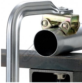
V Pad Jaw