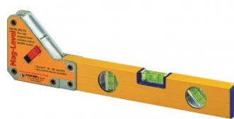
W1020 Magnetic Level