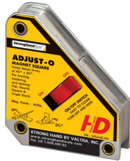
W1007 Adjust-O Magnet Square - Heavy Duty