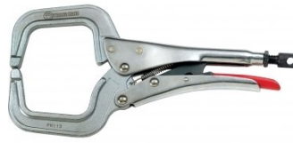
W1017 Locking C-Clamp - Swivel Tip