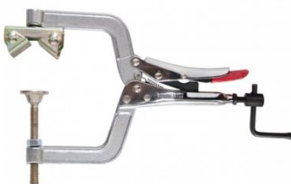
W1015 Pipe Plier