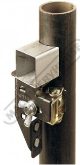
Square Tube Section On Pipe