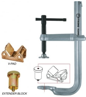
W1026 4 In One Utility Clamping System