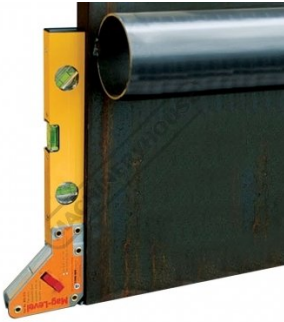
Shown In Use 2