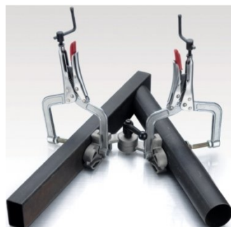
W1012 Adjustable Corner Clamping Plier Set