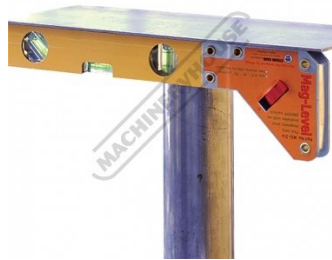
Shown In Use 3