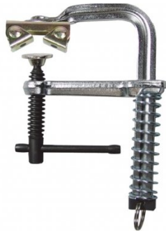
W07970 BuildPro Magspring Clamp