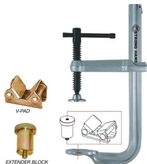
W1025 4 In One Utility Clamping System