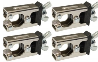
W112 Micro Welding Steel Clamp Set