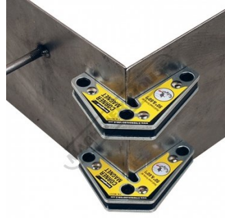
Shown In Use 2