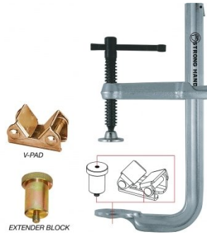
W1025 4 In One Utility Clamping System