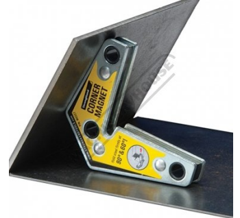
Shown In Use 3