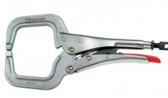
W1017 Locking C-Clamp - Swivel Tip