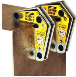
Shown In Use 1