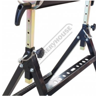
Table Top Height Adjustment 710-925mm