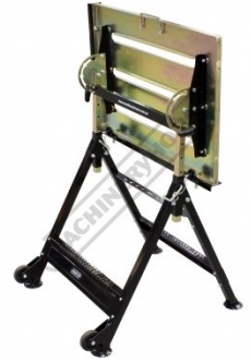
Table Angled at 90 Degree Right Side