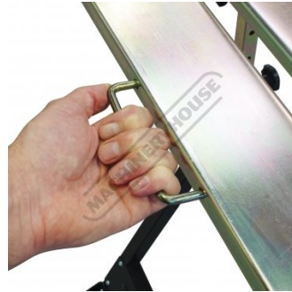
Spring Return Handle