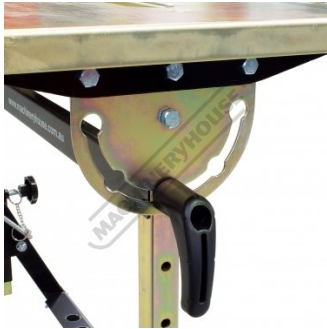
Table Angle Adjustment