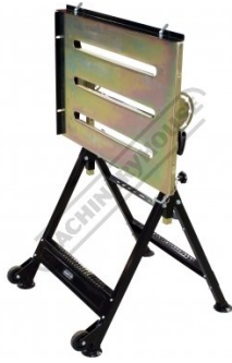
Table Angled at 90 Degrees