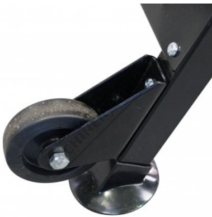
Caster Wheels for Portability