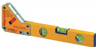
W1020 Magnetic Level