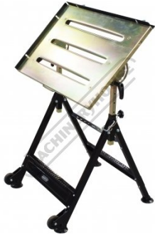
Table Angled at 45 Degrees