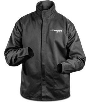
W1003 Rogue Welding Jacket