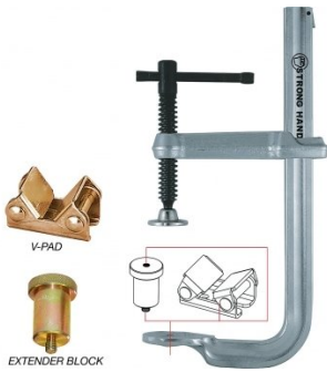
W1025 4 In One Utility Clamping System