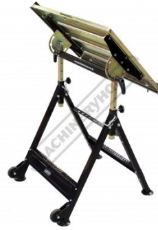
Table Angled at 45 Degrees Right Side