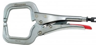
W1016 Locking C-Clamp - Round Tip