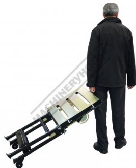
Folds Down For Easy Portability