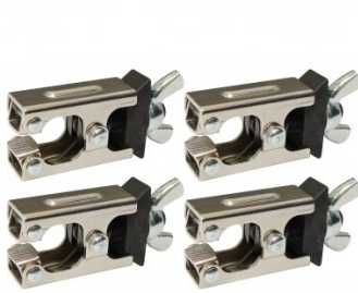
W112 Micro Welding Steel Clamp Set