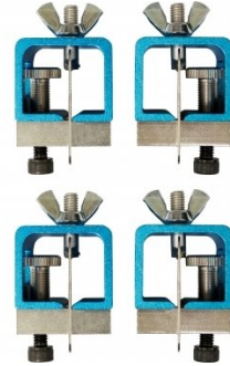
W113 Butt Welding Aluminium & Steel Clamp Set