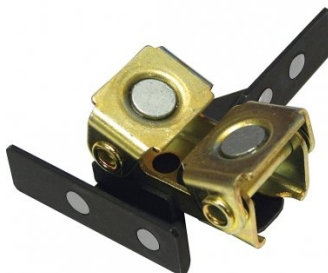
W1023 MagTab AL Magnet