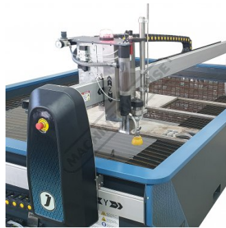
Close Up Head