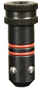
W07892 Ball Lock Pin 16 x 28mm