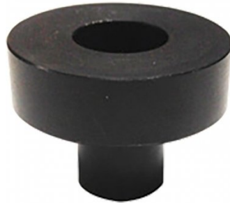
W08012 BuildPro V-Block Spacer