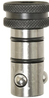
W07891 Ball Lock Pin 16 x 24mm