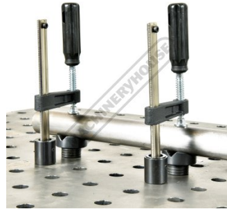
Clamps Shown Clamping Round Tube