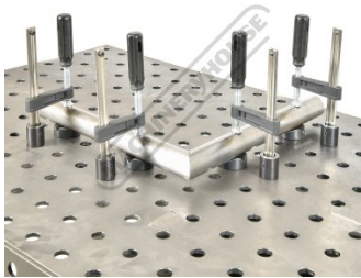
Round Tube Setup with Extra 2 Clamps and V Pads