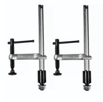
W08511 Weld Clamps with Locking Nuts (2 Piece Pack)