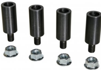
W08516 50mm x M12 Multi-Purpose Riser/Stops (Threaded) - 4pc Pack