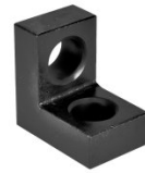
W08320 Right Angle Bracket / Stop