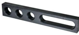
W08343 Straight Bar Stop