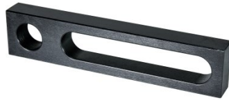
W08342 Straight Bar Stop