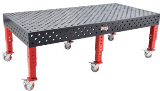
W08260 3000 x 1500mm M28 Pro Series Welding Table