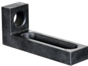
W08321 Right Angle Bracket / Stop