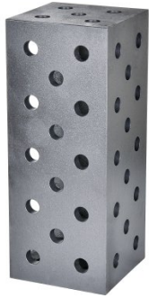
W08350 Riser Block