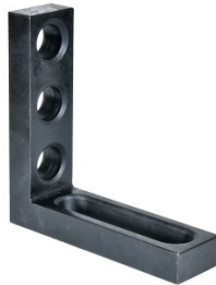
W08324 Right Angle Bracket / Stop