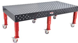
W08260 3000 x 1500mm M28 Pro Series Welding Table