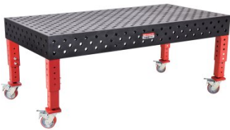
W08257 2400 x 1200mm M28 Pro Series Welding Table