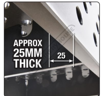
Approx 25mm Thick