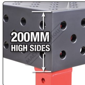
200mm High Sides