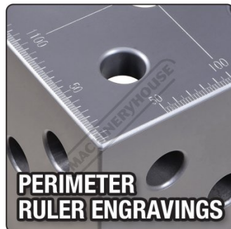
Perimeter Ruler Engravings