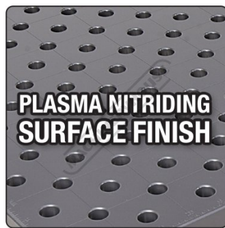
Plasma Nitriding Surface Finish