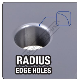
Radius Edge Holes