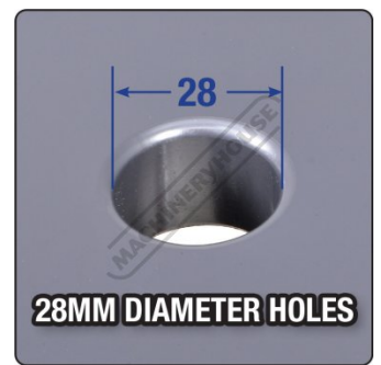
28mm Diameter Holes