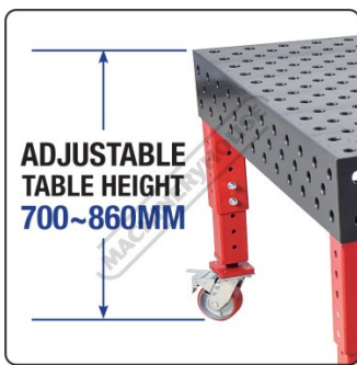
Adjustable Table Height 700 860mm