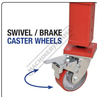
Swivel Brake Wheels