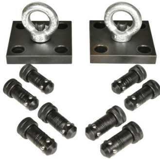
Table & Accessory Lifting Kit