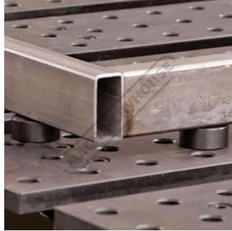
Use the Magnetic Rest Button to elevate workpieces above the tabletop