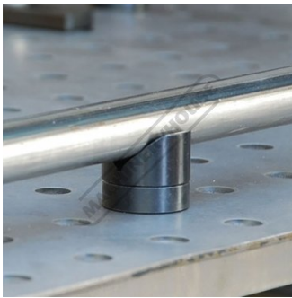
V Block Spacer