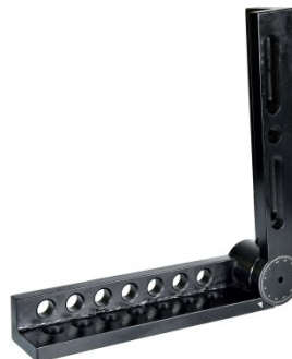
W08329 Adjustable Angle Bracket