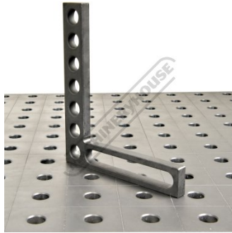
Shown on Welding Table