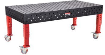
W08257 2400 x 1200mm M28 Pro Series Welding Table