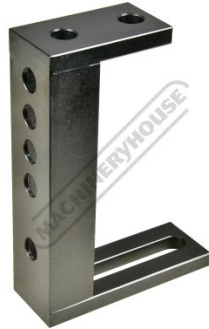
Clamping Square 200mm