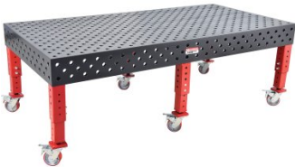
W08260 3000 x 1500mm M28 Pro Series Welding Table