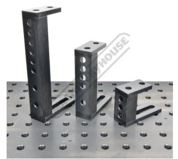
100mm 200mm 300mm Range Available