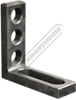
Angle Bracket 90x90x30mm