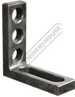
Angle Bracket 90x90x30mm