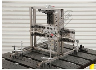
Precision Ground Steel