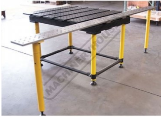
Use to Extend the Length or Width of the BuildPro Table