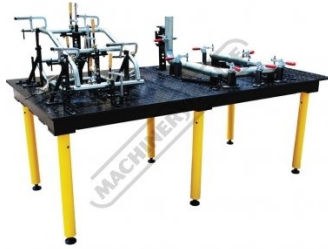
Set Up Heavy Duty Large or Complex Fixtures