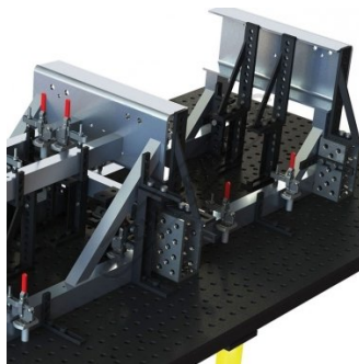
Shown with Optional Clamps Fixtures Setup CloseUp