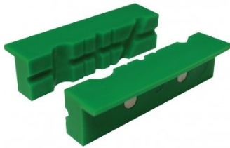
V0544 Plastic Magnetic Soft Jaws