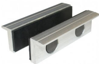
V0534 Aluminium Magnetic Soft Jaws