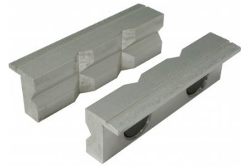
V0537 Aluminium Magnetic Soft Jaws