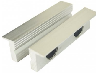
V053 Aluminium Magnetic Soft Jaws