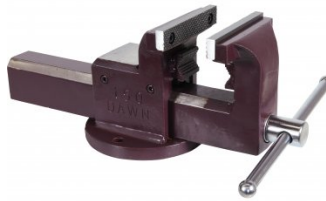
V082 150mm Forge Steel Utility Bench Vice with Anvil & Pipe Jaws