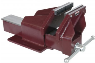
V071 200mm Steel Offset Fabricated Bench Vice