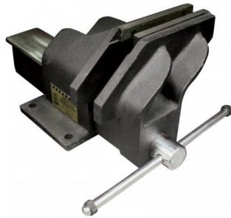
V067 152mm Steel Offset Fabricated Bench Vice