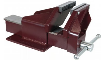
V070 150mm Steel Offset Fabricated Bench Vice