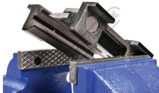
Heavy Duty Mounting Magnets