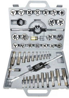
T015 Imperial Alloy Steel Tap & Die Set - 45 Piece