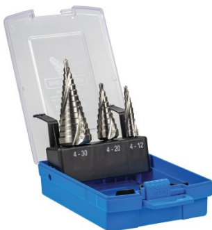
D107 HSS Step Drill Sets