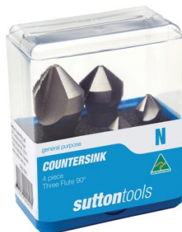
D106 Countersink Sets – 90° Three Flute