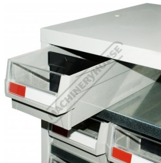
Parts Bin with Clear Window