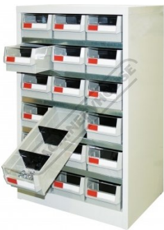
Drawers with Dividers