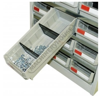
Drawer with Dividers Shown with Parts