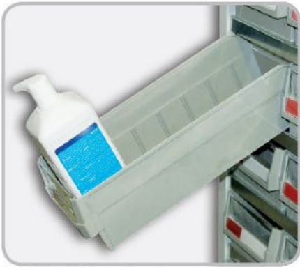
Safety Lip design