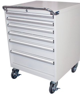
T768 6 Drawer - Industrial Mobile Tooling Cabinet