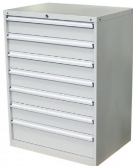
T772 7 Drawer - Industrial Tooling Cabinet