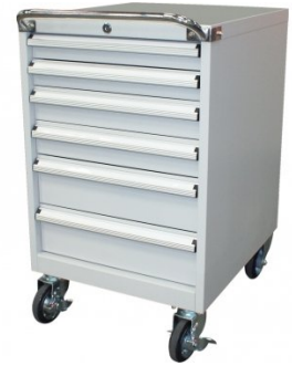
T765 6 Drawer - Industrial Mobile Tooling Cabinet