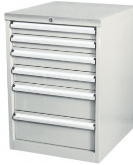
T764 6 Drawer - Industrial Tooling Cabinet