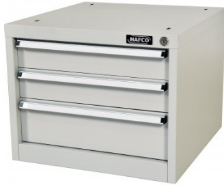
A423 3 Drawer - Industrial Under Bench Tooling Cabinet