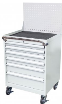
K068 6 Drawer - Industrial Mobile Tooling Cabinet with Backing Panel Package Deal