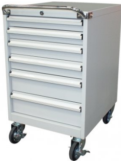
T765 6 Drawer - Industrial Mobile Tooling Cabinet