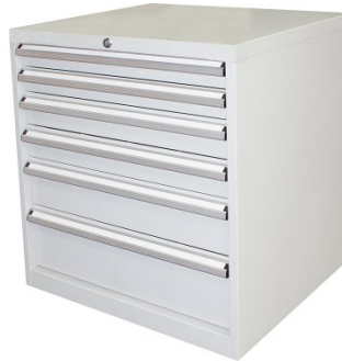
T767 6 Drawer - Industrial Tooling Cabinet