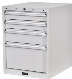
T7684 4 Drawer - Tooling Cabinet