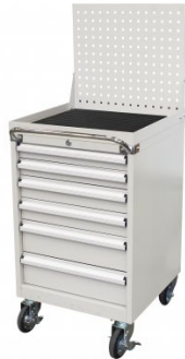
K065 6 Drawer - Industrial Mobile Tooling Cabinet with Backing Panel Package Deal