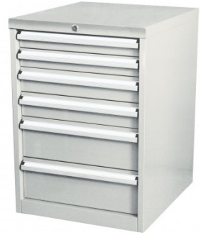
T764 6 Drawer - Industrial Tooling Cabinet