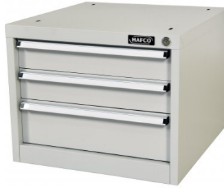
A423 3 Drawer - Industrial Under Bench Tooling Cabinet