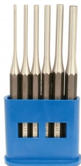
P365 Pin Punch Set - 6 Piece