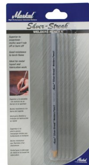
W104B Silver Streak - Welders Pencil