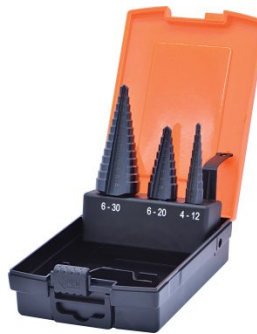
D1071 HSS Sheet Metal Step Drill Set - 3 Piece