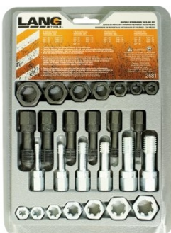
T116 Imperial Thread Restorer Tap & Die Kit - 26 Piece Set