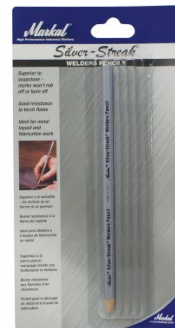
W104B Silver Streak - Welders Pencil