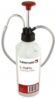
G076 Top Up Pump