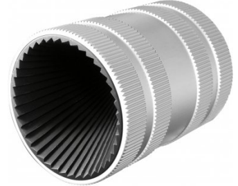
D068 Pipe/Tube Deburring Tool - Internal / External