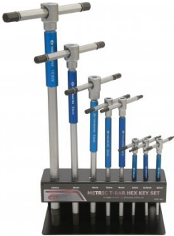
H820 Metric Hex Key Set with T-Bar Handle