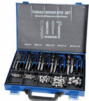
T100 Metric Thread Repair Kit - 130 Piece