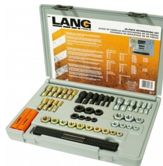
T117 Metric, UNC, UNF Thread Restorer Tap & Die Kit - 48 Piece