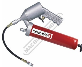
G074 Air Operated Grease Gun