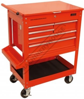
Left View with Lid Closed