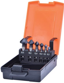
D1061 HSS Countersink Set (90° 3 Flute Type) - 6 Piece