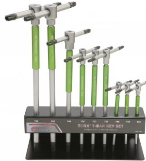
H822 Torx® Key Set with T-Bar Handle