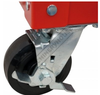
2x Swivel Brake Wheels