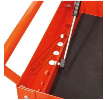
Internal Side Screwdriver Storage Bay