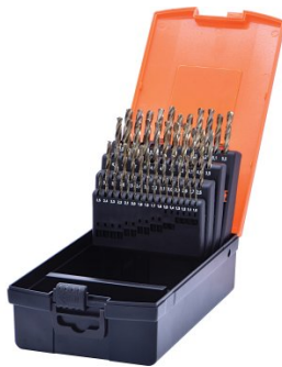
D1285 Metric 135° Precision HSS Drill Set - 51 Piece