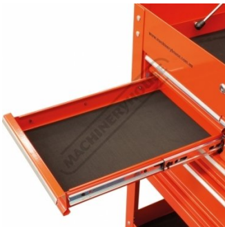
Drawers With Protective Liners