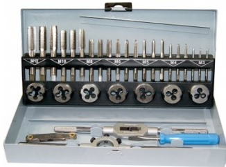
T013 Metric HSS Tap & Die Set - 32 Piece