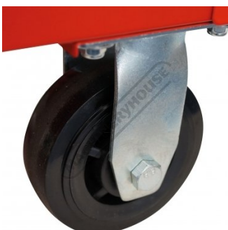
2x Fixed Wheels