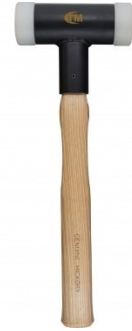
H880 Dead Blow, Nylon Face Hammer