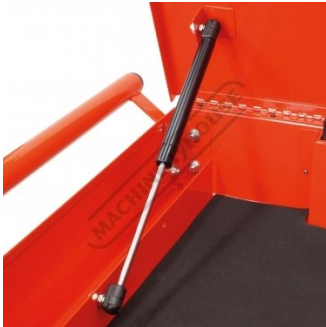
2 x Lid Gas Strut Supports