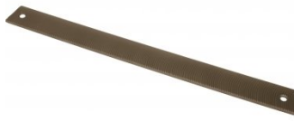
F156 Flexible Body File