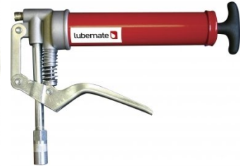
G070 Grease Gun