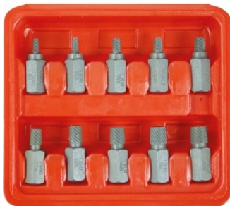
T870 Screw Extractor Set - 10 piece