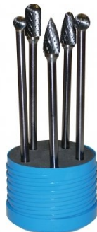
B905 Carbide Burr Double Cut Set - Long Series