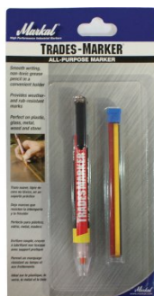
W104 Trades Marker - All Purpose