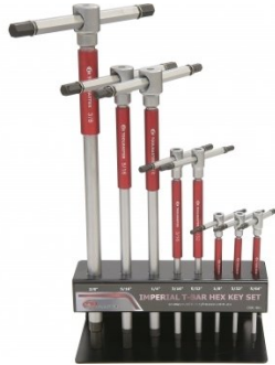
H821 Imperial Hex Key Set with T-Bar Handle