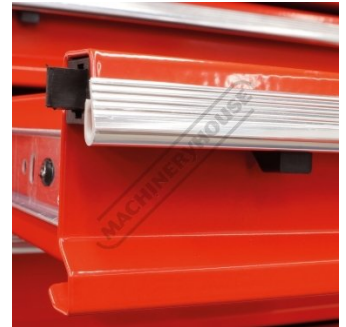
Safety Drawer Latches