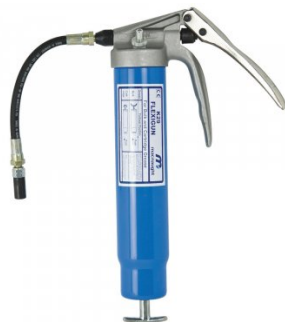
G063 Grease Gun