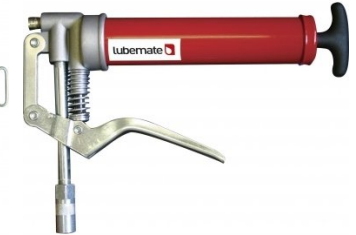
G070 Grease Gun