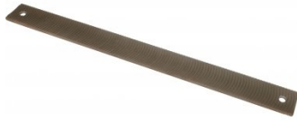
F155 Flexible Body File