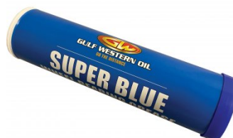
G057 Super Blue Complex Grease Cartridge