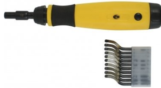
D060 Deburring Tool - Telescopic Shaft