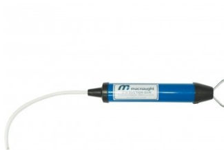
G065 Suction Gun - Oil Transfer