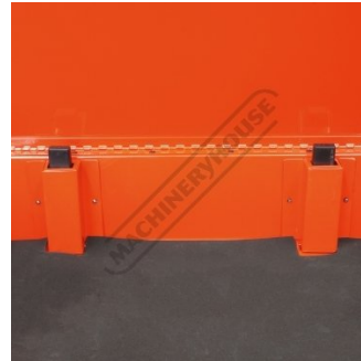
Drawer Locking System