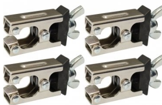
W112 Micro Welding Steel Clamp Set