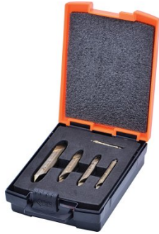
D508 HSS Industrial Centre Drill Set – 5Pcs