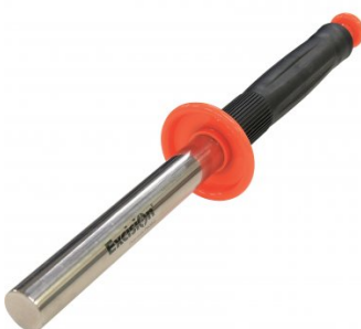
L300 Magnetic Swarf Remover