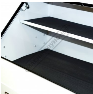
Shelf in top compartment