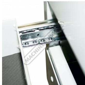
Ball Bearing Side Rails