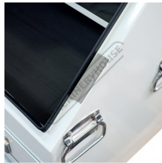
Rubber Seal with Cushion Pad