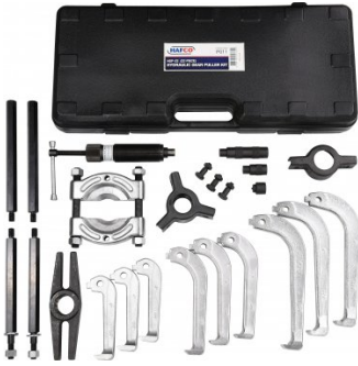
P011 Hydraulic Gear Puller Kit