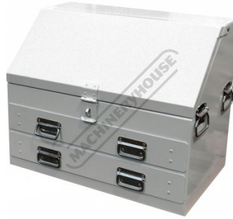
Right View all Drawers Closed