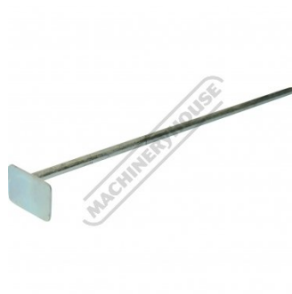
Pin for Drawer locking System