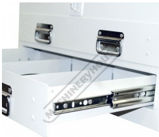
Ball Bearing Slide Drawers