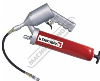
G074 Air Operated Grease Gun