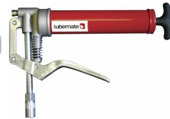
G070 Grease Gun