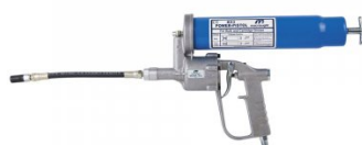
G066 Air Operated Power Pistol - Grease Gun