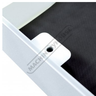
Drawer Pin Hole For Locking System