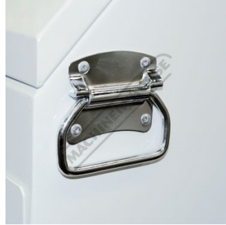
Side Lifting Handles