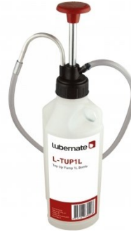
G076 Top Up Pump