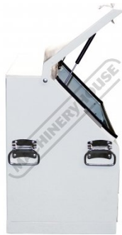
Side View with Lid Open