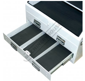
Bottom Drawer Open