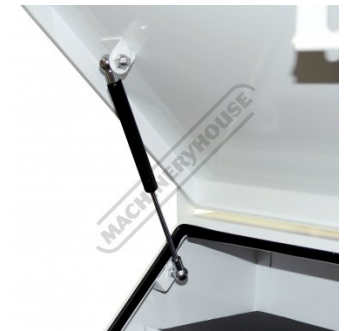
Gas Strut Lid