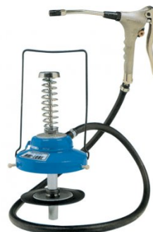
G060 Grease Gun