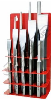
P364 Punch & Cold Chisel Set - 14 Piece