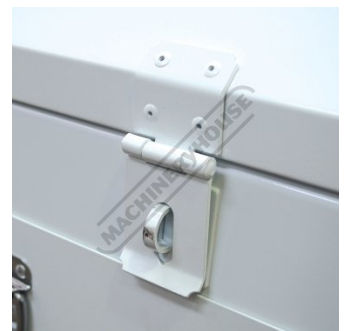
Latch for optional pad lock