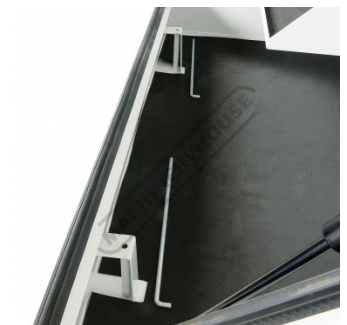
2 x Drawer Lock Pins