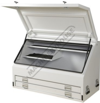
Right View Lid Open