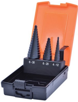
D1071 HSS Sheet Metal Step Drill Set - 3 Piece