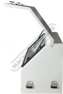
Side View with Lid up