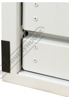
Rubber Cushion Pad for Lid