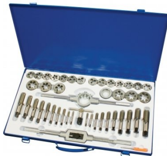
T016 Metric HSS Tap & Die Set - 45 Piece