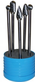
B905 Carbide Burr Double Cut Set - Long Series