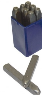
P355 Number Punches