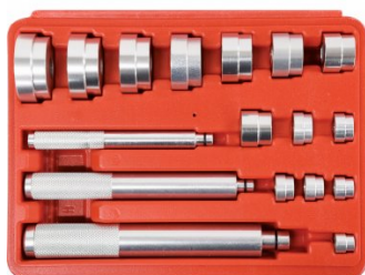
P030 Bush Driver Set - 17 piece