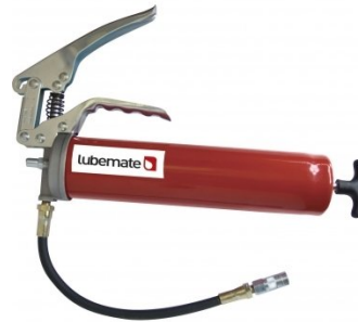
G072 Grease Gun