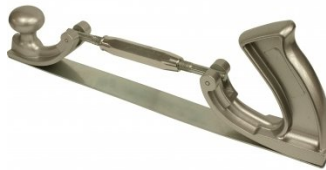
F150 Flexible Body File Holder