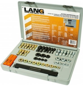
T117 Metric, UNC, UNF Thread Restorer Tap & Die Kit - 48 Piece