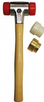
H870 Soft Face Hammer