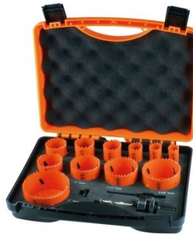
D102 Metric HSS Hole Saw Set