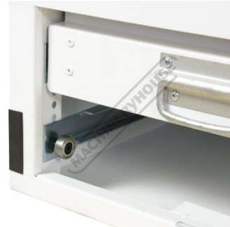
Drawer Runner with Ball Bearing