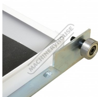
Drawer with Roller Ball Bearing