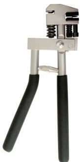
S200 Joggler & Punch Plier