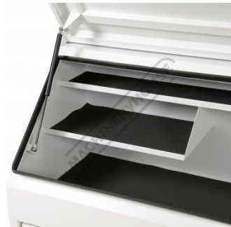
2 Storage Shelves