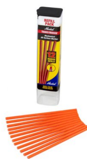
W104A Orange Trades Marker Refills - All Purpose