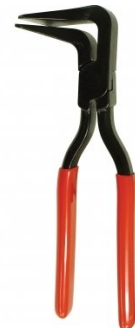
S205 90° Edge/Seaming Plier