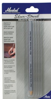
W104B Silver Streak - Welders Pencil