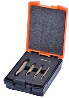
D508 HSS Industrial Centre Drill Set - 5Pcs