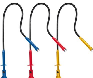
M0010 Pick Up Tool with Magnetic Head & 1 x LED Light