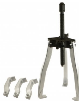
P005 Ratcheting Gear Puller Set