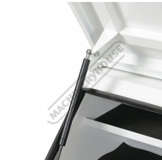
Gas Strut Lid