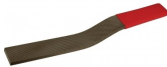
F160 Slapping File - Second Cut