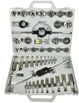
T014 Metric Alloy Steel Tap & Die Set - 45 Piece