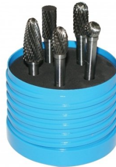
B900 Carbide Burr Double Cut Set - Short Series