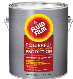
O044 Rust & Corrosion Preventive