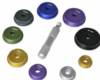
P031 Bearing Race & Seal Driver Set - 10 piece