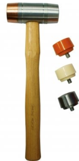
H875 Soft Face Hammer - 5 piece