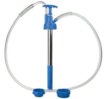
G077 Oil Transfer Pump