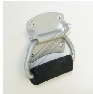
Side Lifting Handles