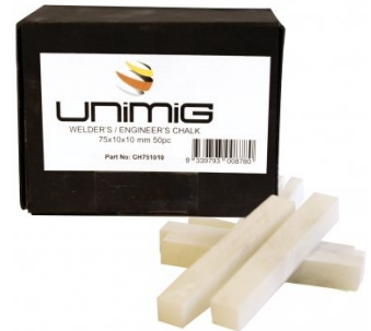
W103 Engineers Chalk Marker- 50 Splits