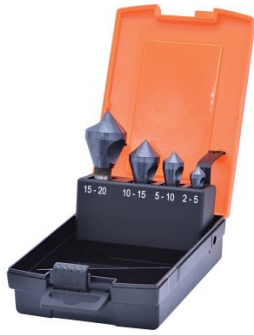
D1051 HSS Countersink Set (90° Cross Hole Type) - 4 Piece