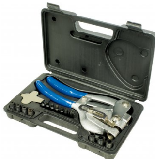
P112 Hole Punch Set