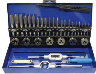
T012 Metric Alloy Steel Tap & Die Set - 32 Piece