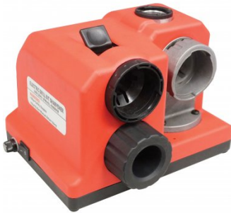
D070 Drill Sharpener