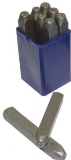
P351 Number Punches