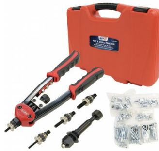
N001 Nut & Blind Riveter Set - 130 Piece