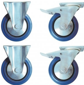
C411 Industrial Caster Wheel Set