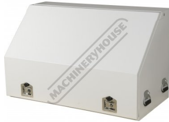
Right View Lid Closed