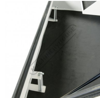
2 x Drawer Locks